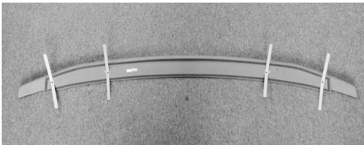
Hole locator locations