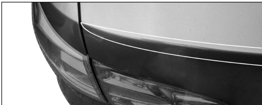
DIAGRAM B: Outline spoiler with a grease pencil