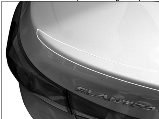
DIAGRAM B: Outline spoiler with a grease pencil