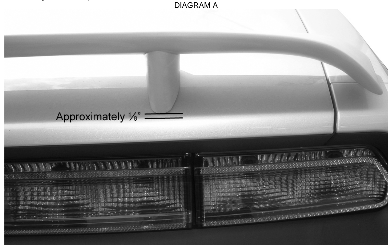
Place rear most mounting foot approximately 1/8" from definite edge.

9. Clean up all metal shavings and you are done. If you have any questions or if you would like information about other quality Sportwing<sup>®</sup> products please call the TOLL FREE number at the top of this sheet. Thank you for choosing Dawn Enterprises, Inc.