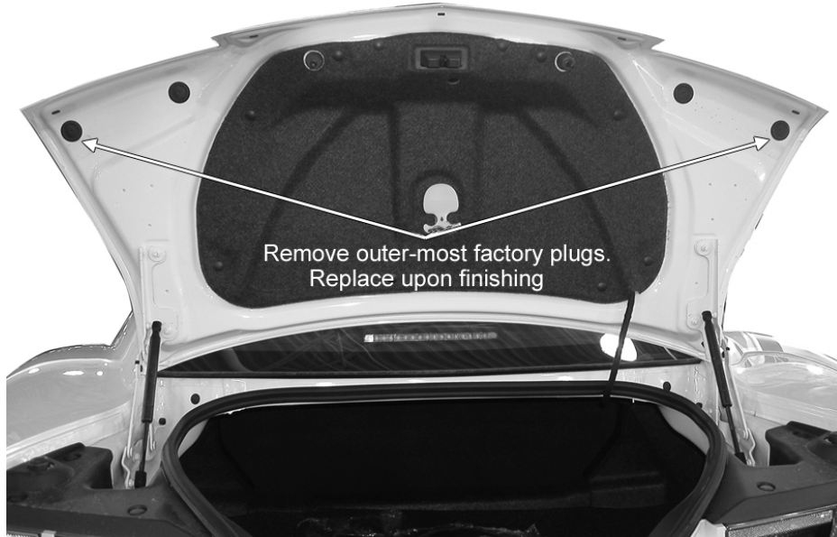
Remove factory plug on drivers' and passenger sides.