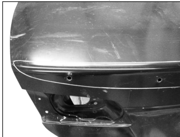
DIAGRAM A: Grease pencil outline