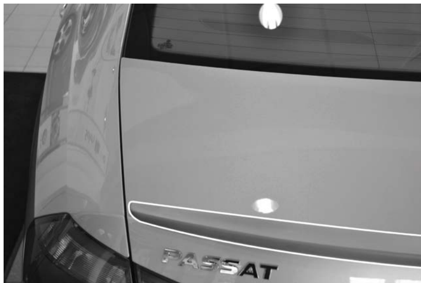
DIAGRAM B: Outline spoiler with a grease pencil