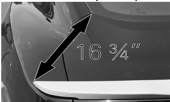
DIAGRAM A (HARDTOP)