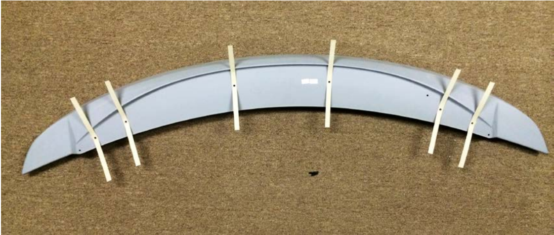
DIAGRAM C – Finished Product