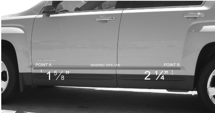
Measure up from top of cladding