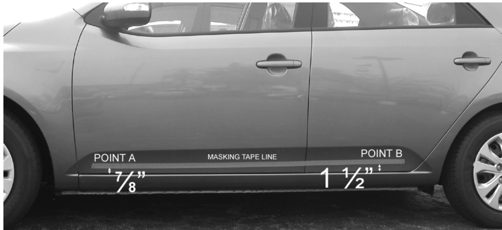
Measure up from the bottom of the doors