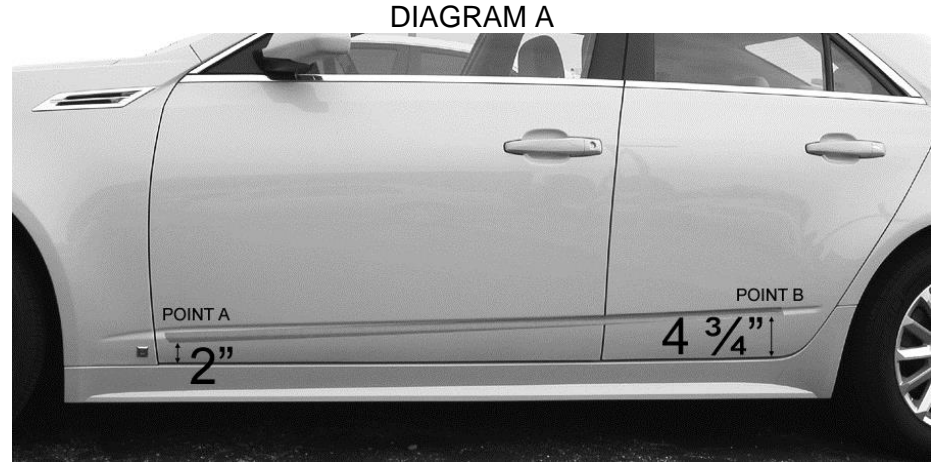
Measure up from the bottom of the doors to the bottom edge of the masking tape.

Using masking tape, run the tape as shown using measurements in Diagram A below from POINT A to POINT B. Press tape against the vehicle, making sure that the tape is straight from POINT A to POINT B.