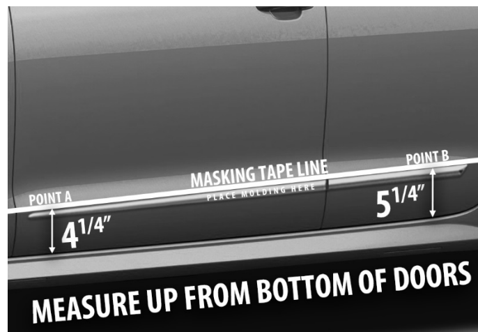
DIAGRAM A Measure up from bottom of doors

Run masking tape as shown using measurements in Diagram A below from POINT A to POINT B. Press tape against the vehicle, making sure that the tape is straight from POINT A to POINT B.