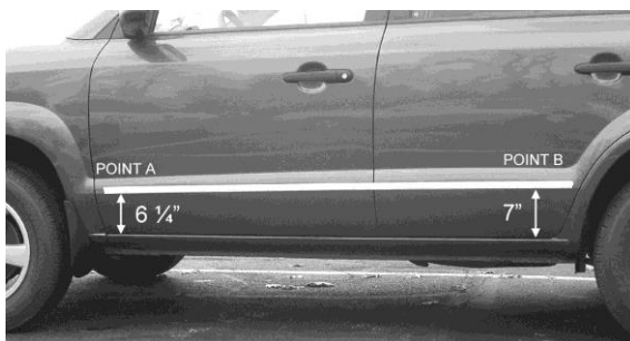
Model Year 2007 - 2009

AFTER THE MOLDING has been installed, use a soft cloth and apply pressure along the entire length of the molding to insure proper adhesion. Remove masking tape and you will have an OEM style Custom Body Side Molding that will give you many years of protection.