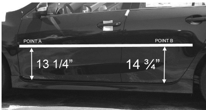
2010 - 2013 Mazda 3 Sedan/Hatchback

AFTER THE MOLDING has been installed, use a soft cloth and apply pressure along the entire length of the molding to insure proper adhesion. Remove masking tape and you will have an OEM style Custom Body Side Molding that will give you many years of protection.