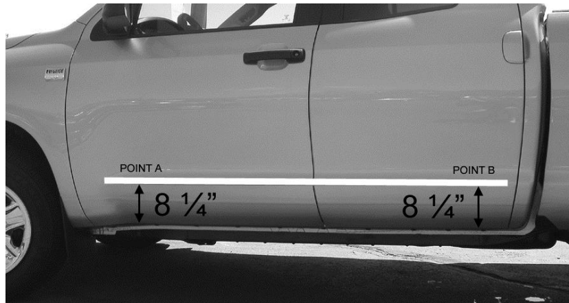
Measure up from bottom of doors