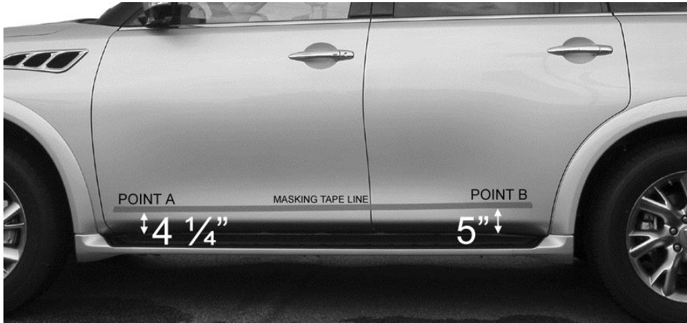
Measure up from bottom of doors