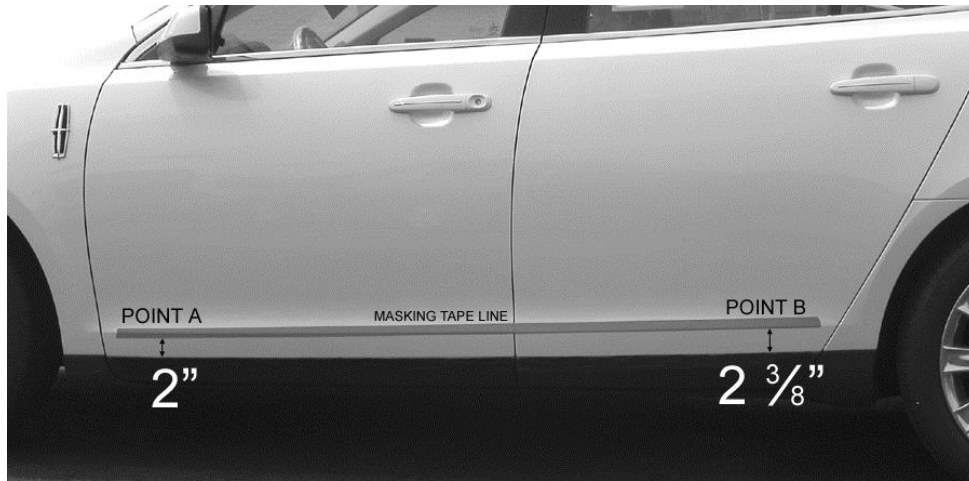
Measure up from top of cladding