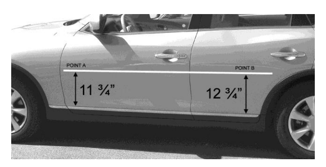
2009 + Infiniti EX35