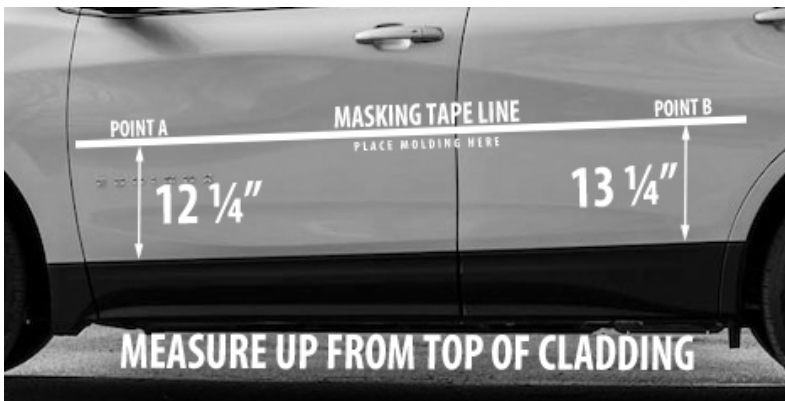
2018+ Chevrolet Equinox