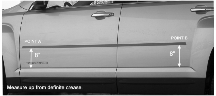
2010 - 2017 GMC Terrain