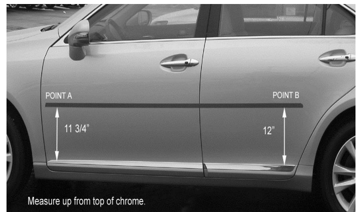
2010 - 2012 Lexus ES350