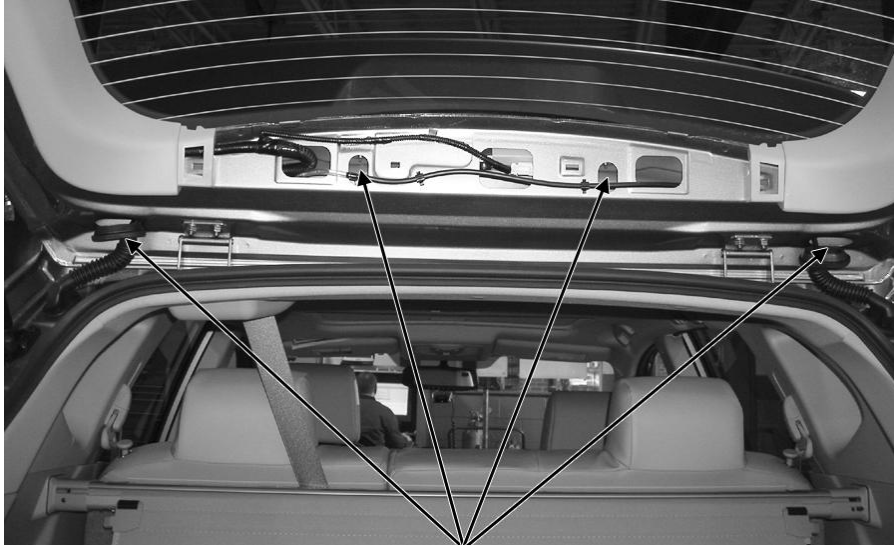
Four openings in secondary panel for fastening of Sportwing®