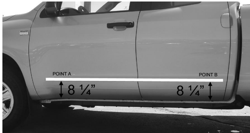
Measure up from bottom of doors