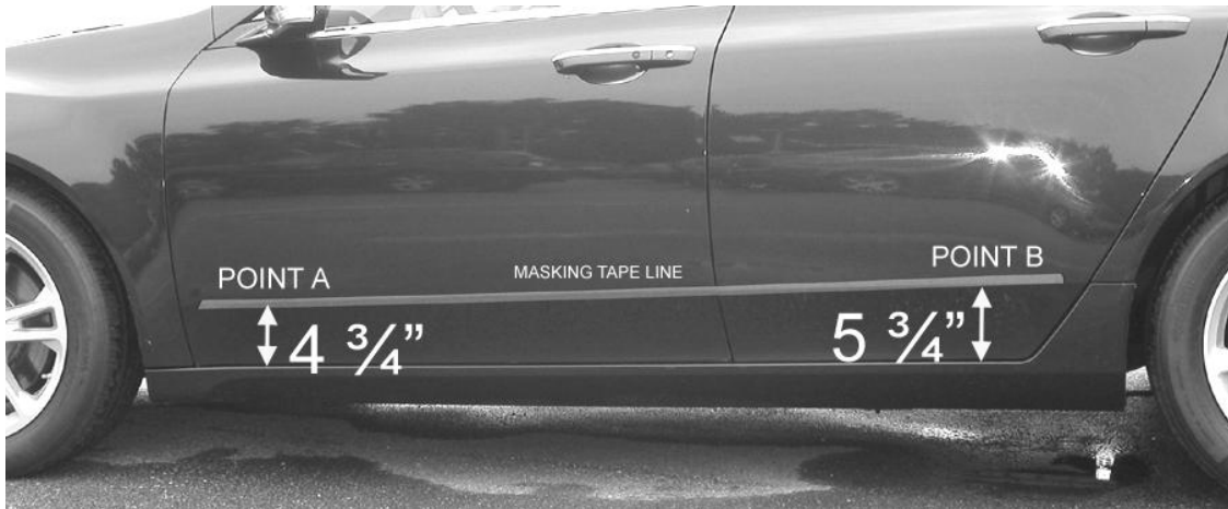
Measure up from the bottom of the doors