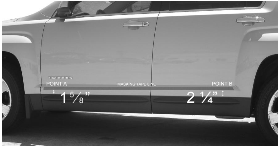
Measure up from top of cladding