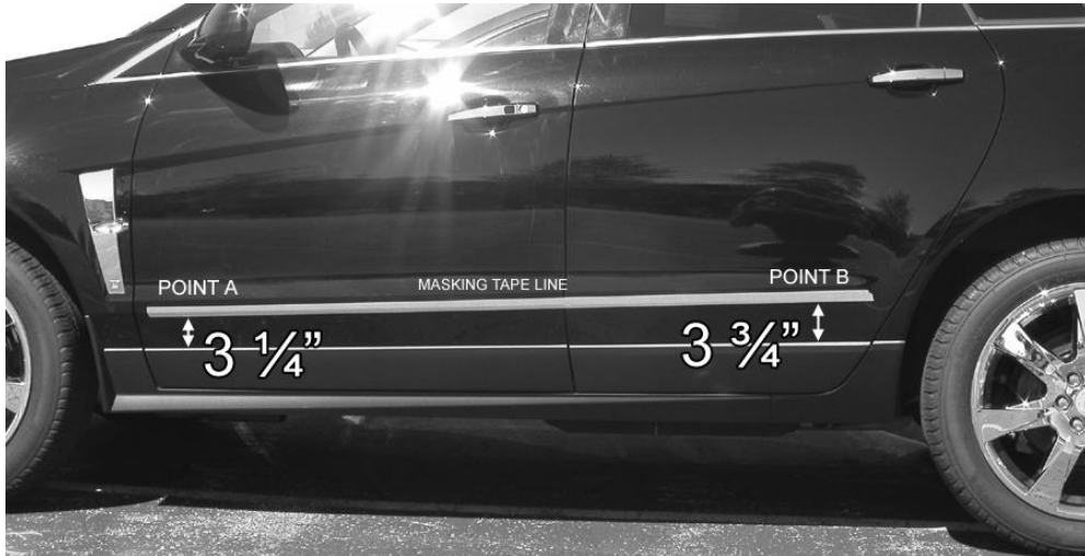
Measure up from top of cladding