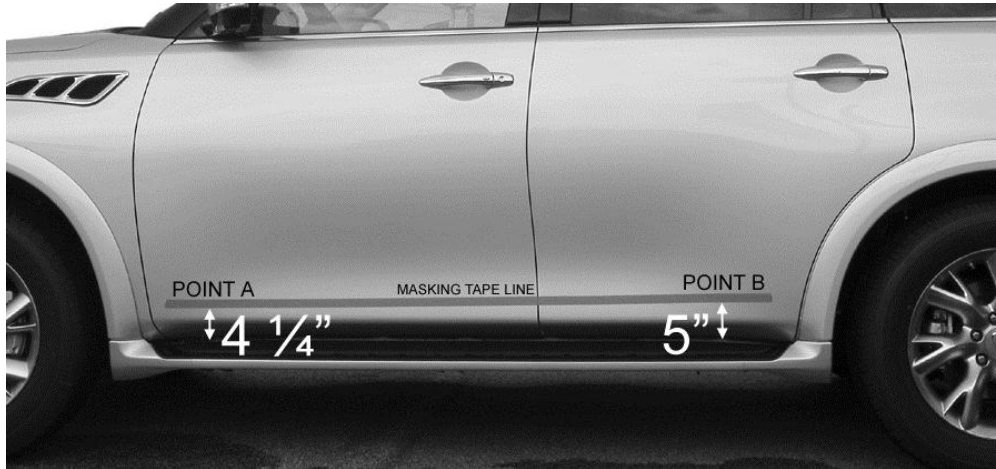
Measure up from bottom of doors