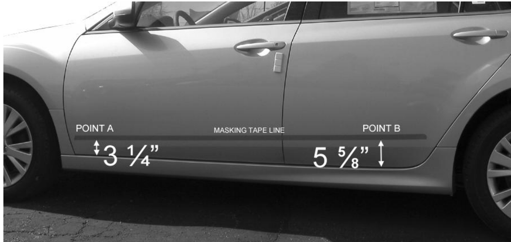
Measure up from the bottom of the doors