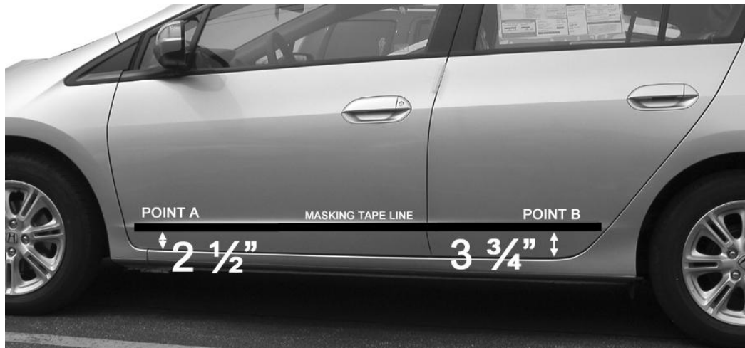
Measure up from the bottom of the doors