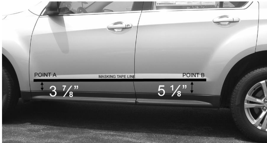
Measure up from the top of black cladding