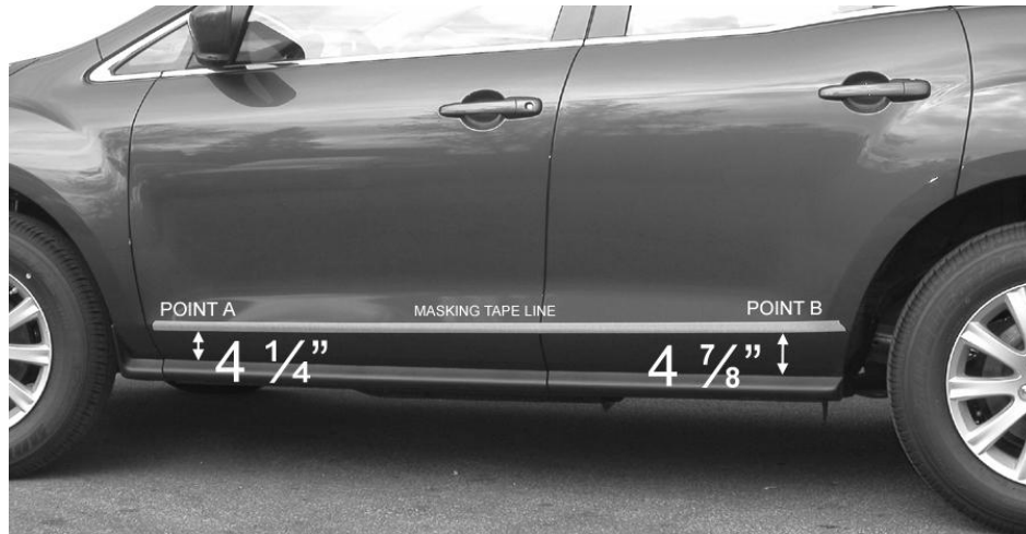
Measure up from top of black cladding