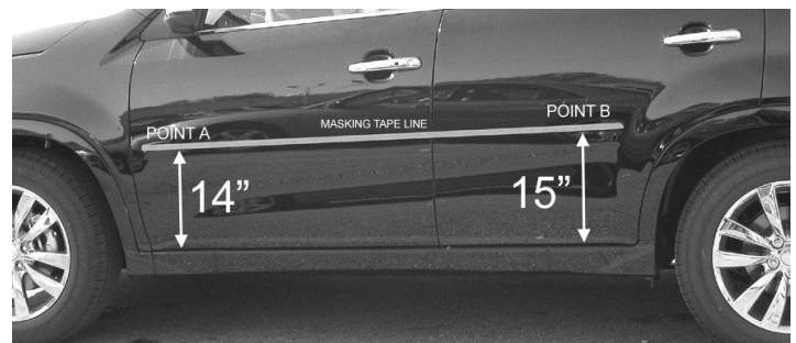
If model does NOT have cladding, measure up from bottom of doors.