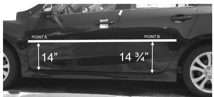
2010 & Up Mazda 3 • 5 Door