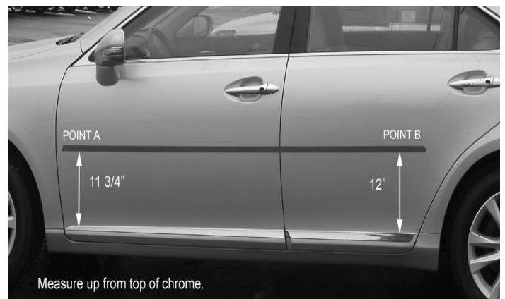
2010 & Up Lexus ES350