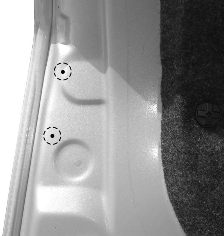
DRIVERS' SIDE DECK LID

5/32" drill bit should exit at these approximate areas of secondary panel of deck lid when drilling through spots on template. Next, using a 5/8" hole saw, open these 5/32" pilot holes to 5/8". Open to give you access to the top panel of the deck lid. Black hole caps have been provided for these holes upon finishing.