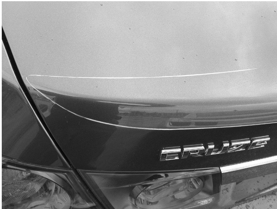
Outline marks on deck lid made in Step #2. Repeat on passenger side.